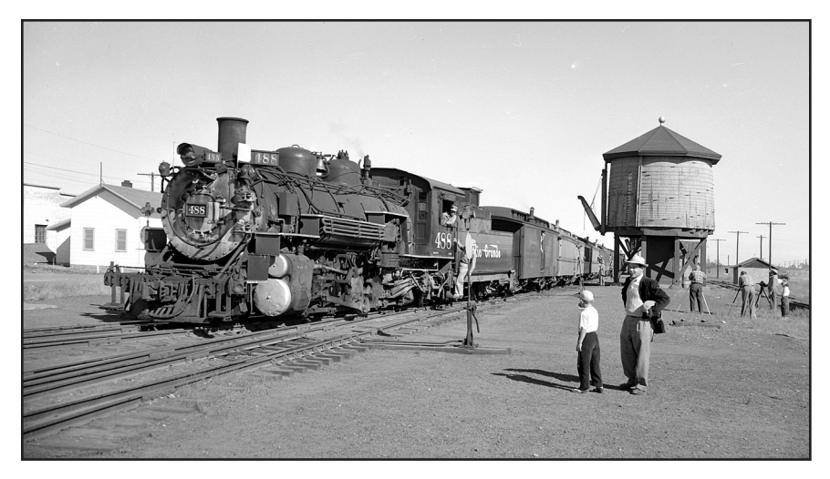
One of the Club's annual Memorial Day trips over the narrow gauge pauses at Antonito. Colorado.