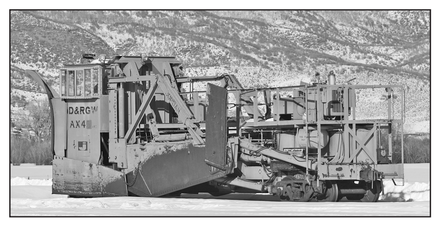
D&RGW Jordan spreader AX45 was in the yard at Phippsburg, Colorado, on January 21, 2015. It was the last piece of snow fighting equipment that the Rio Grande bought before the mergers.