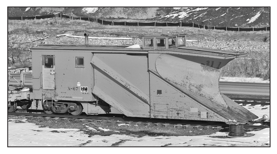
UP plow X-67 was built in 1950 and is stationed at Glenwood Springs, Colorado, here on January 10, 2015.

returning #844 to service and the restoration and eventual operation of the Big Boy, #4014.